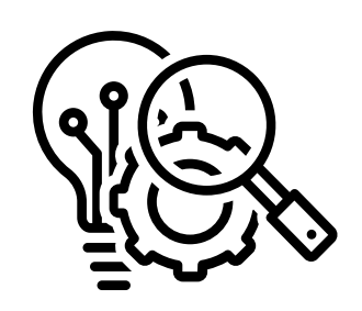
EDUCATION & YOUTH DEVELOPMENT